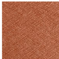
Copper Pearl Fabric