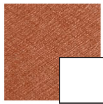
Copper Pearl Fabric